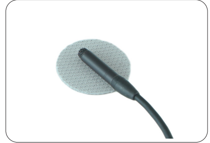
STICKY DISCS | PAGES: 6