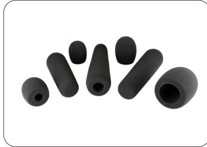
FOAM WINDSCREENS | PAGE: 5