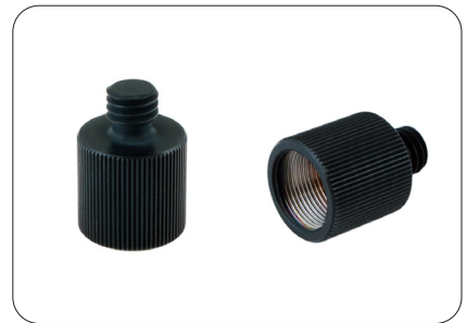
STAND ADAPTOR | PAGE: 9