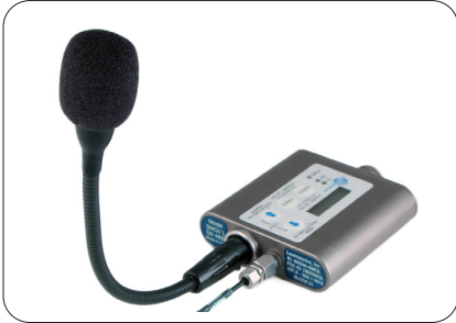
TX-FLEX MINI GOOSENECK OMNI MIC FOR LECTRO | PAGES 3-4