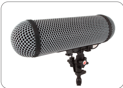
"BLIMP" WINDSHIELDS | PAGES: 10-11