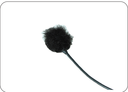
COVERS LAVALIER FUR DISCS | PAGES: 7