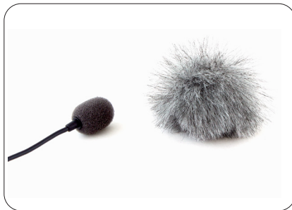
LAVALIER FOAM & FUR WINDSHIELDS | PAGES: 8